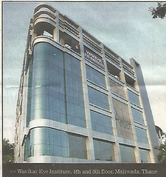
>> Wavikar Eye Institute, 4th and 5th floor, Majiwada, Thane

abroad. A number of lucrative jobs in Institutes for eye care also exist. Those with an entrepreneurial bent of mind could start with their own establishment providing eye care for the masses gaining public